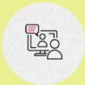
One-Time Career Connection Events