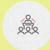
4-Week HR Talent Accelerator