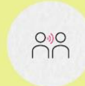
3-Month Career Mentoring Program