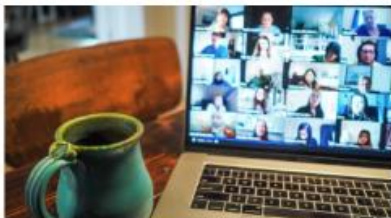
Pathways & Perspectives

Our national and local virtual career mentoring events are designed to increase students' awareness of HR career pathways, gather HR career insights, and expand HR professional networks. SHRM student members and non-student members can attend multiple Career Connections Events.